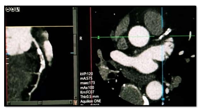
Figure 2: shows three vessels disease. LAD shows subtotal proximal occlusion due to mixed plaque; LAD is visualized in its mid and distal course (1.5mm)