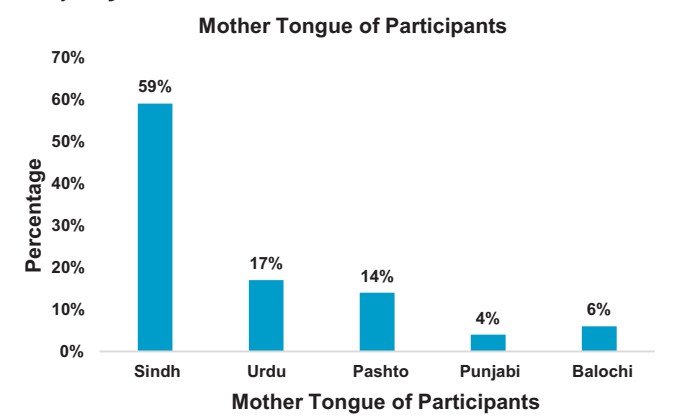
Figure 2: Mother Tongue Categories of Selected Students from Four Batches of BSN Generic

In this study participants belong to five different backgrounds, (59.00%) were Sindhi in this study, 17.0%. Contributors were Urdu speaking, 14.00% of the participant's mother tongue was Pashto, 4.00% were Punjabi speaking and 6.00% of the participant's mother tongue was Balochi in the study. 52.00% of participants were female and 48% of participants were male, in this study(Figure 2).